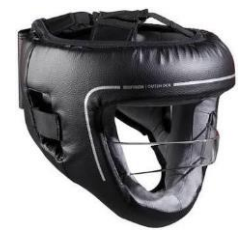
Boxing protective gear