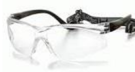
Squash Protective eyewear