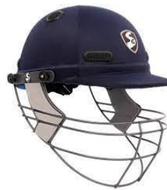
Cricket protective gear