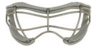
Hockey protective gear